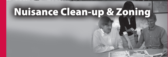
Nuisance Clean-up & Zoning

The JEDZ is a way to maintain and expand current township services WITHOUT raising property taxes